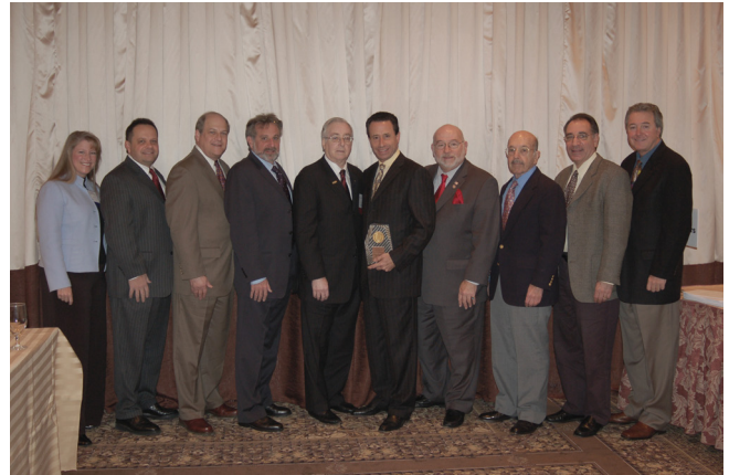
MCDS Delegates accept our Golden Apple Award

“...I lift my lamp beside the golden door!”