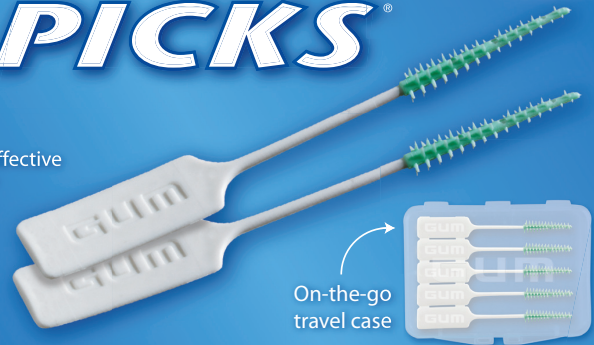
On-the-go travel case

96% of Dental Hygienists who tried Soft-Picks® said they would recommend them to their patients. Available nationally in major retail outlets.