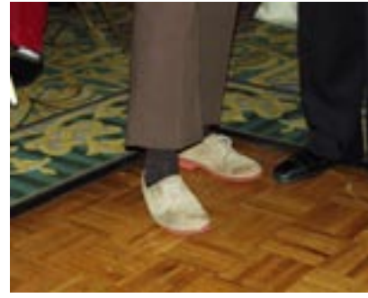
Some people are leaders; others are followers. Only a true leader would be confident enough to wear pants like these. Guess who this is (answer in next month's newsletter).