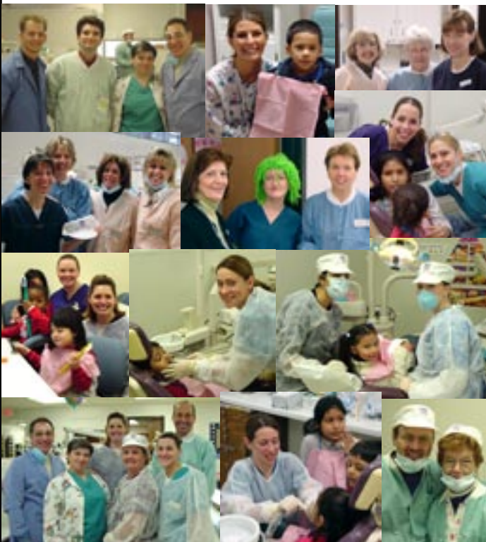
Photos taken at the Middlesex Community College site