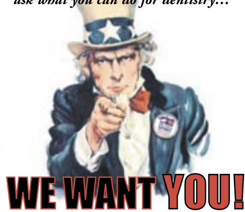
The NJDA is mobilizing member dentists and their staff for the second annual GIVE KIDS A SMILE DAY

"Ask not what dentistry can do for you, ask what you can do for dentistry..."