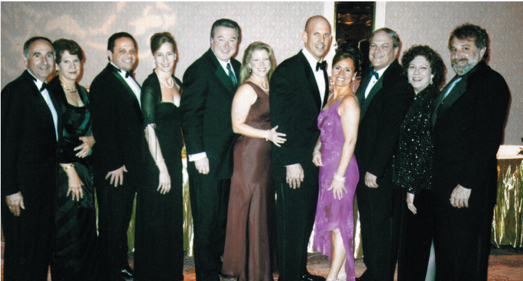
MCDS Past Presidents and their guests