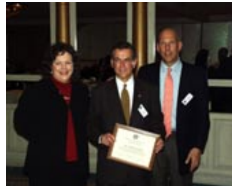
Dr. Stanley Cohen