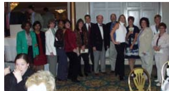
Staff Night Prize Winners