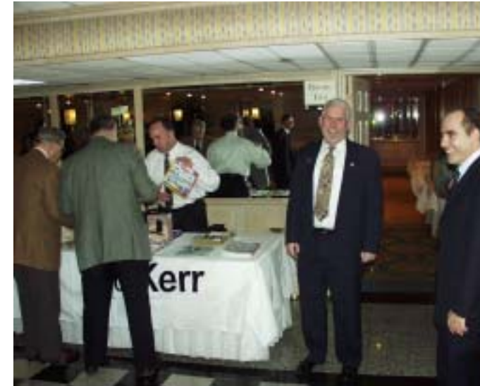
Members visit the Tri-State Booth